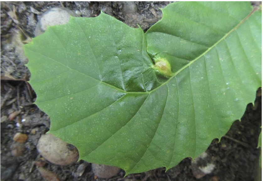
Small gall forming on the side of the leaf midrib causing leaf distortion.