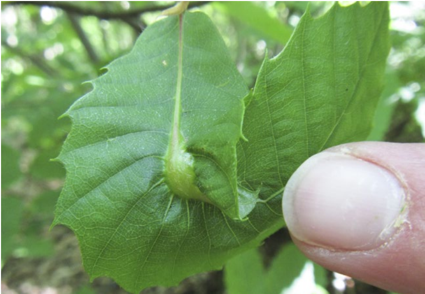
Galls formed by the larvae of OCGW on sweet chestnut leaves.