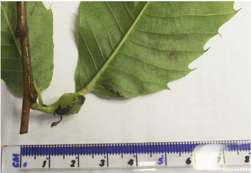
OCGW gall on the leaf petiole (stalk).