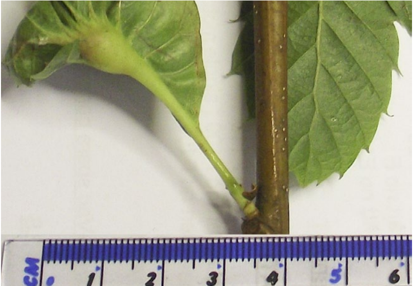
OCGW gall on the leaf petiole (stalk).