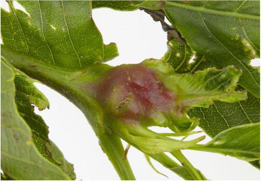
Rose coloured OCGW gall.