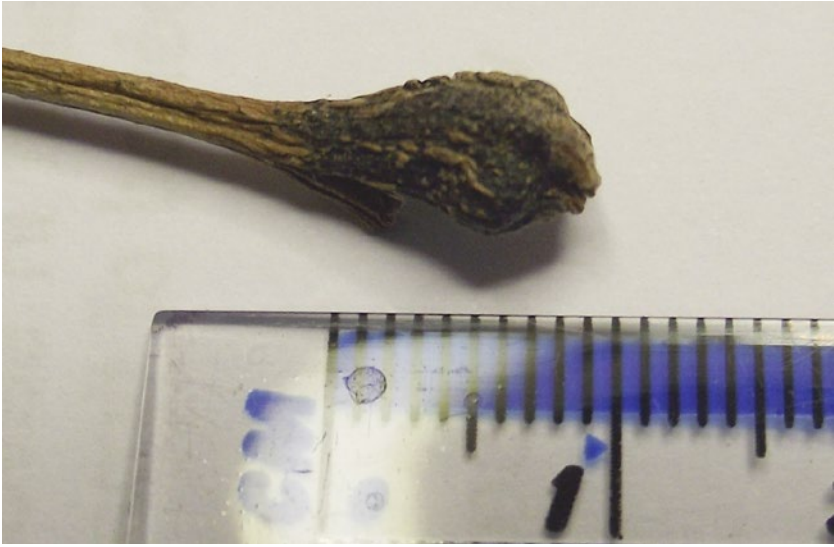
OCGW gall over 1 year old, shrunken and lignified and far more difficult to spot than the fresh galls.