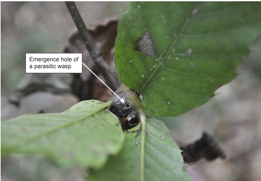
Hardened gall with the emergence hole of a parasitic wasp.