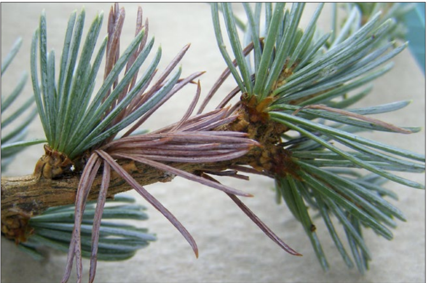
Pink coloration of needles of an Atlas cedar tree infected with Sirococcus tsugae .