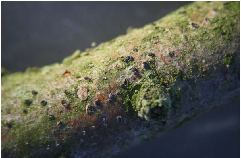
Sirococcus tsugae fruiting bodies (small black dots) on the dead needles of an infected tree.