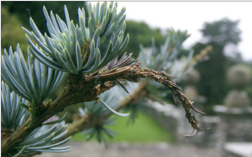
Wilting shoots and pink needles of an Atlas cedar tree infected with Sirococcus tsugae .