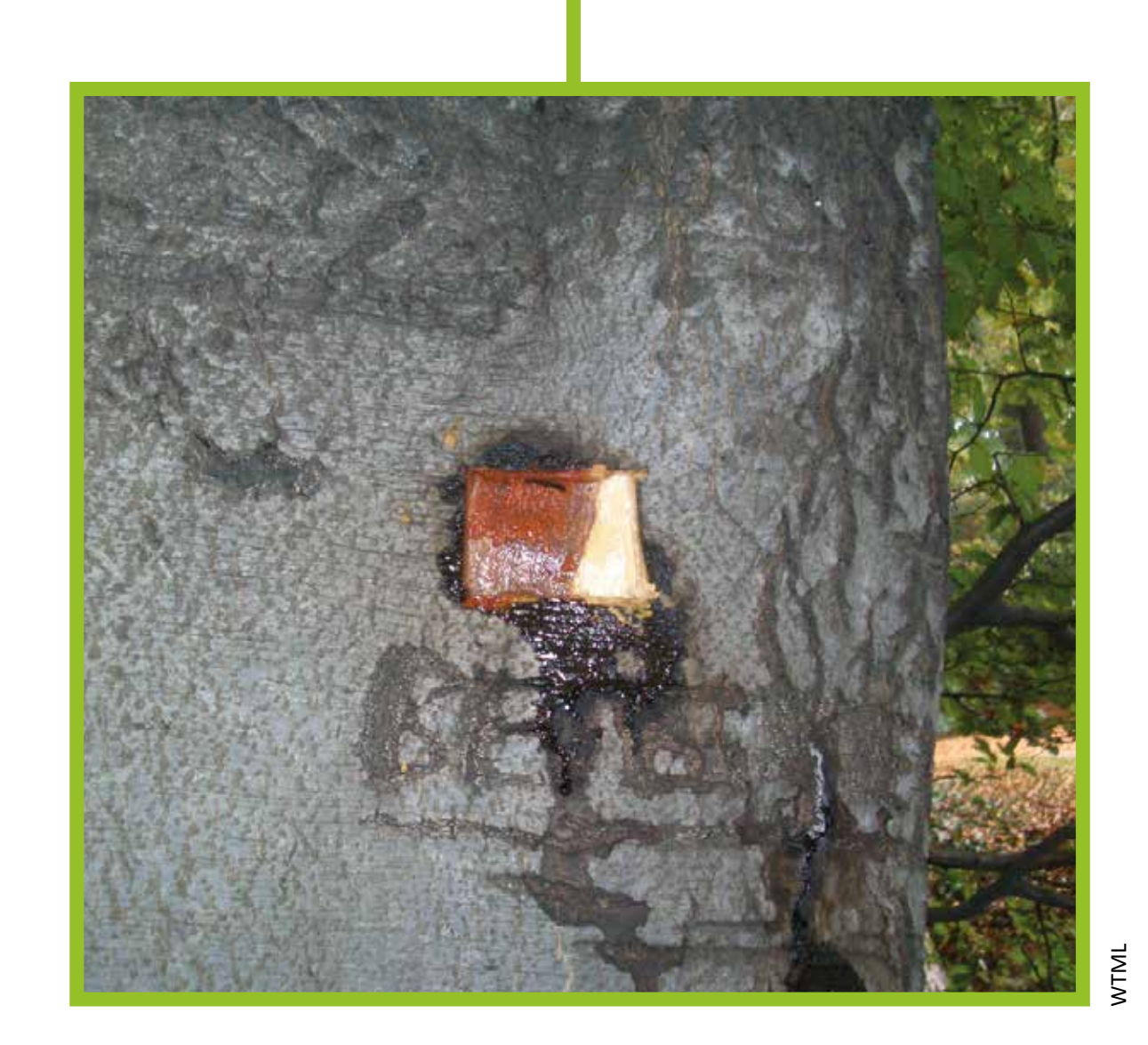
Bleeding on infected beech