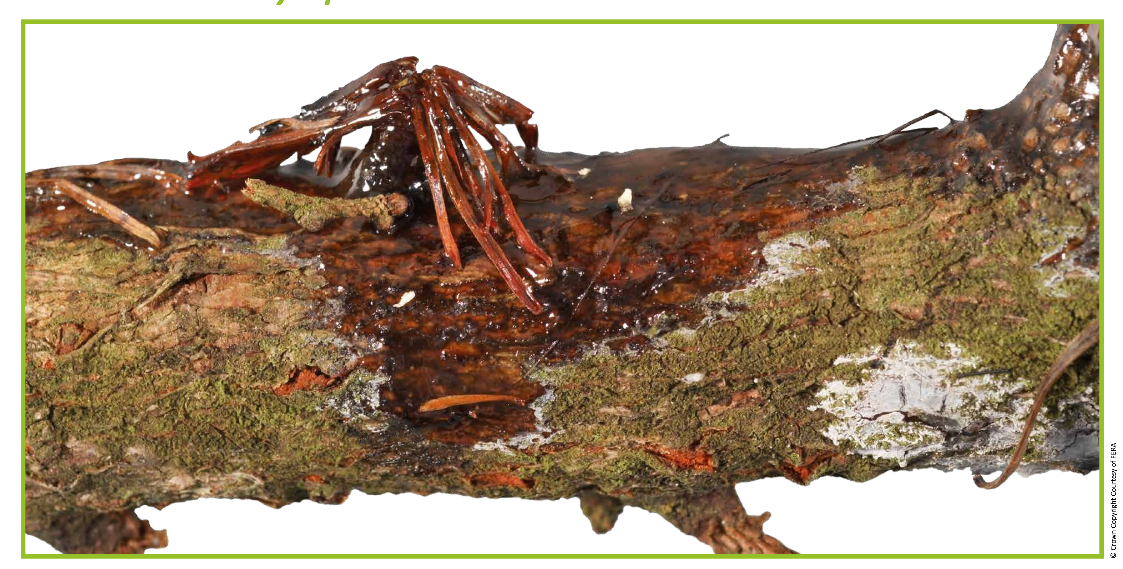
Resin bleeding on infected larch