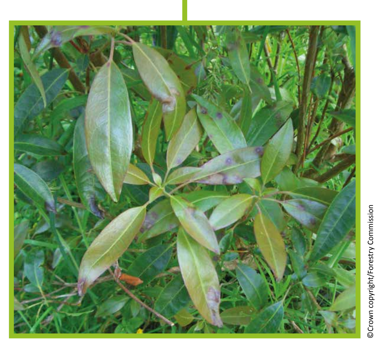
Infected rhododendron leaves