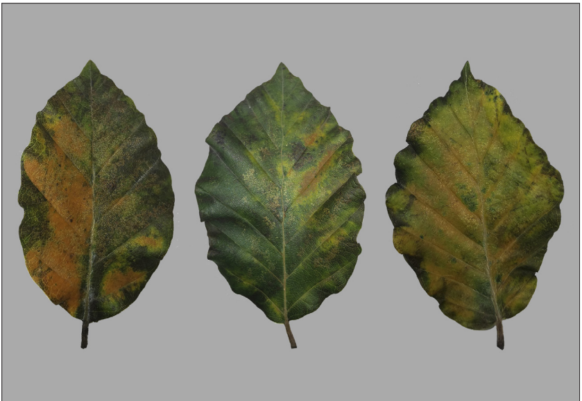
Beech leaf with necrotic spots caused by Petrakia liobae .