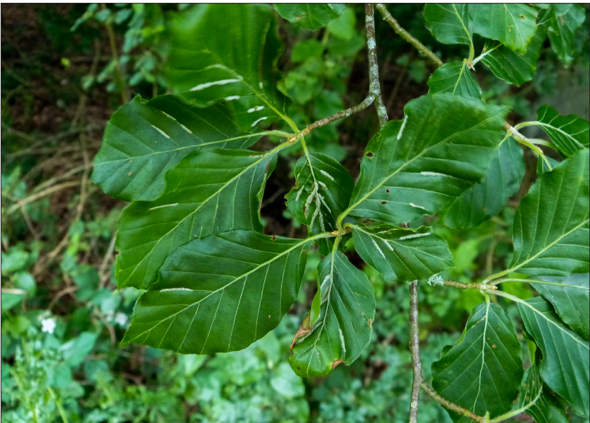
Anthracnose caused by Apiognomonina errabunda on Fagus sylvatica .