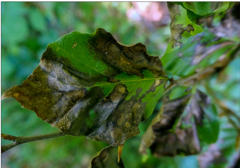
Possible insect blotch-mine on beech leaves.