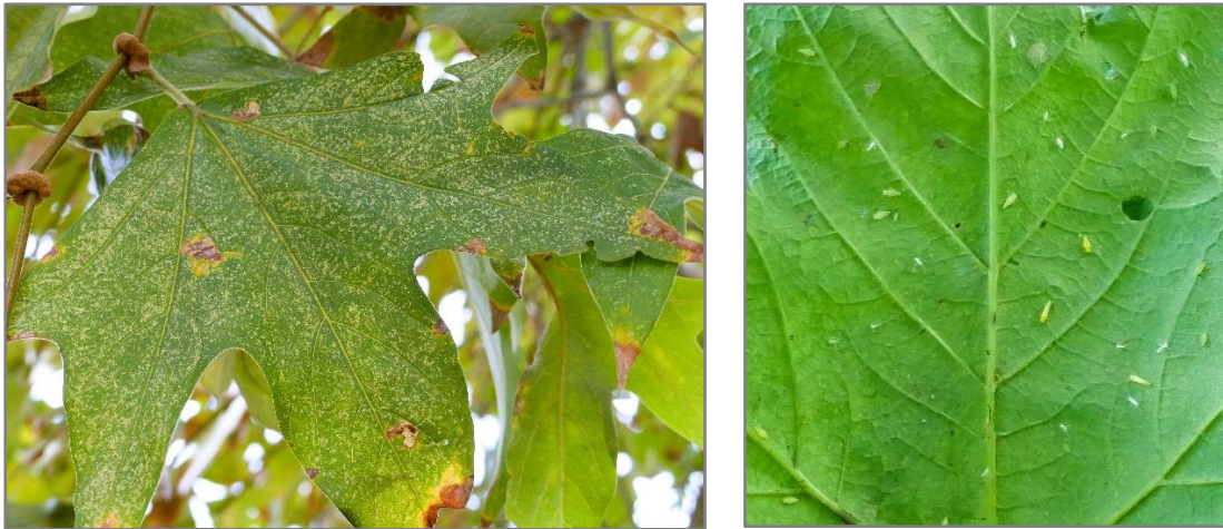
Figure 5: Typical leaf hopper related damage on plane, and leaf hoppers on the underside of a sycamore leaf (Fera Science Ltd.)