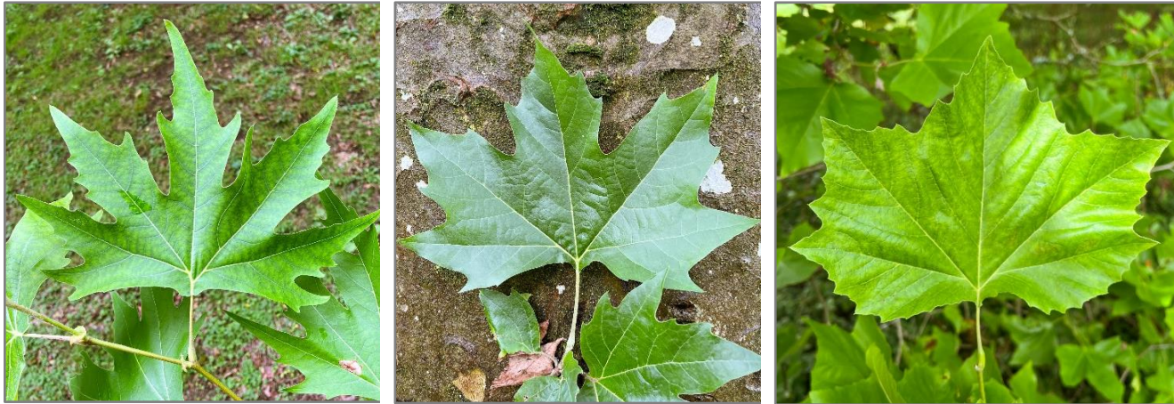
Figure 2: Left to right - leaves of Oriental plane, London plane and Western plane (Westonbirt Arboretum)