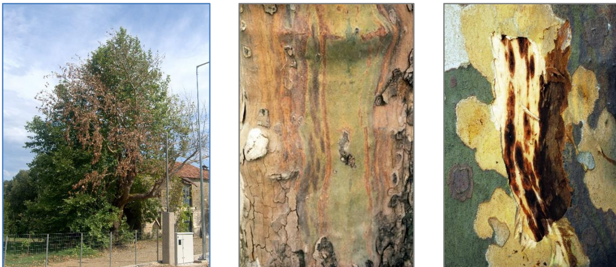
Figure 6: Plane wilt symptoms (left to right) – isolated wilting/dead foliage (P. Tsopelas & N. Souliorti, FIRA, Greece), sunken canker with typical peripheral orange-purple colouring (© Crown copyright. Forest Research), and exposed lesion beneath the bark (© Crown copyright. Forest Research).

Plane wilt is a fungal disease of Oriental, Western, and London planes. It affects the water transport systems of the tree causing wilting of leaves and shoots and is usually fatal within 5-7 years. The fungus is native to North America and was first found in Europe in Marseille, France, in 1972. It is now present in France, Italy, Switzerland, and Greece. A population in Spain is in the process of being eradicated.