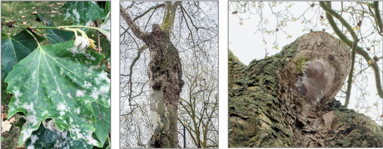
Figure 8: (L-R) Plane powdery mildew symptoms, large on a plane tree trunk canker caused by Fomitoporia , and a Fomitoporia fruit body (all images © Crown copyright. Forest Research).