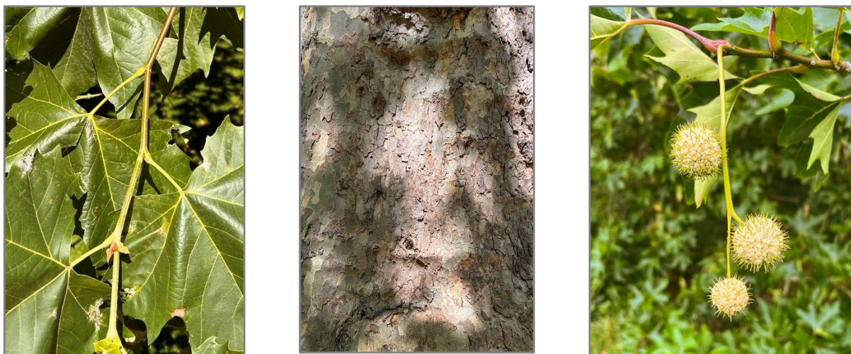
Figure 3: Left to right - alternate leaf arrangement and swollen petiole bases, typical bark (© Crown copyright. Forestry Commission) and pom-pom fruits of London plane (Westonbirt Arboretum).