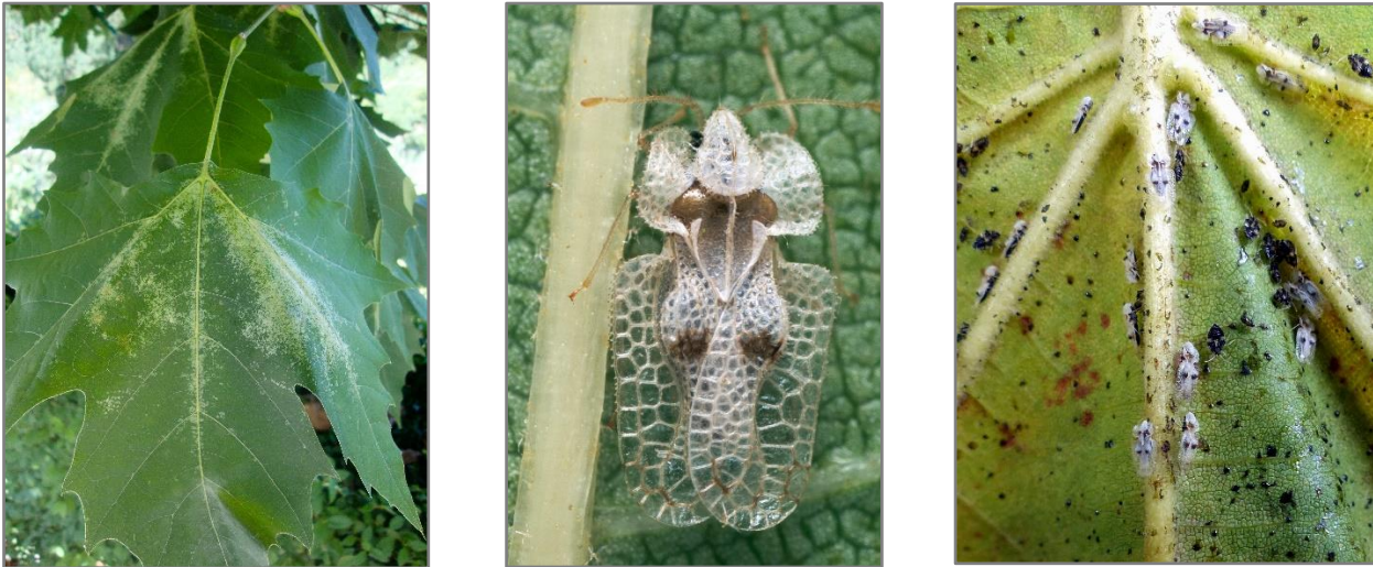
Figure 4: Left to right - foliage spotting and discoloration caused by lace bugs, adult lace bug, and adults and nymphs with spots of frass on the underside of a plane leaf.

can be produced each year and both adults and nymphs are often found together on the underside of leaves where they feed on the sap, usually with abundant fresh and dried frass (fig. 4). Besides the damage they can cause to plane trees there have also been reports of plane lace bugs biting people and causing dermatosis.