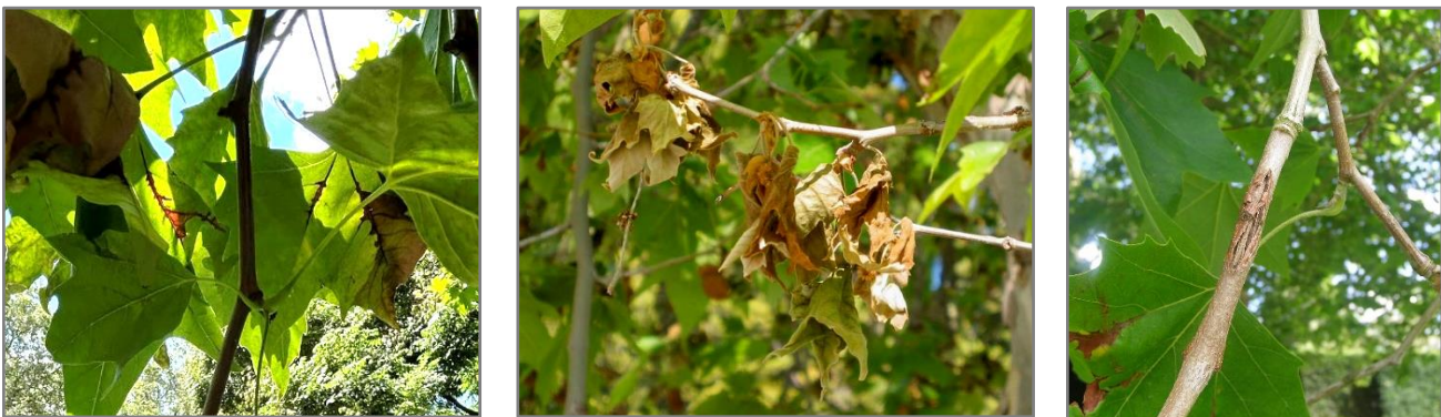
Figure 7: Plane anthracnose symptoms (left to right) – leaf blight with brown staining along veins, twig blight with wilted/dead leaves, and canker on a young twig.

Western plane is particularly susceptible to Anthraxnose ( Apiognomonia veneta ), Oriental plane is moderately tolerant and susceptibility in London plane varies depending upon clone. The most visible symptom is the leaf-blight which presents as brown staining along the veins of leaves. Closer inspection will usually reveal cankers on the twigs or larger branches, shoot blight follows if these girdle stems (fig. 7). Frost and salt damage can give similar symptoms but in those cases twig cankers will be absent. Unlike plane wilt this fungus is not usually fatal.