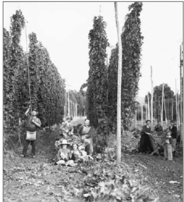
Figure 1: Hop pickers and hops growing up twines supported by hop-poles, Kent

The species is not native to the UK but is widespread and probably arrived in the British Isles with the Romans. The edible nuts are not reliably produced in the UK, but large areas were planted in the 19 th century and managed as coppice. Depending upon the length of the coppicing cycle this could produce poles suitable for post and rail fencing (20-35 years) or chestnut paling and hop poles (12-18 years). In the case of the latter the poles provided supports for the strings which the hop plants twine around (fig. 1).