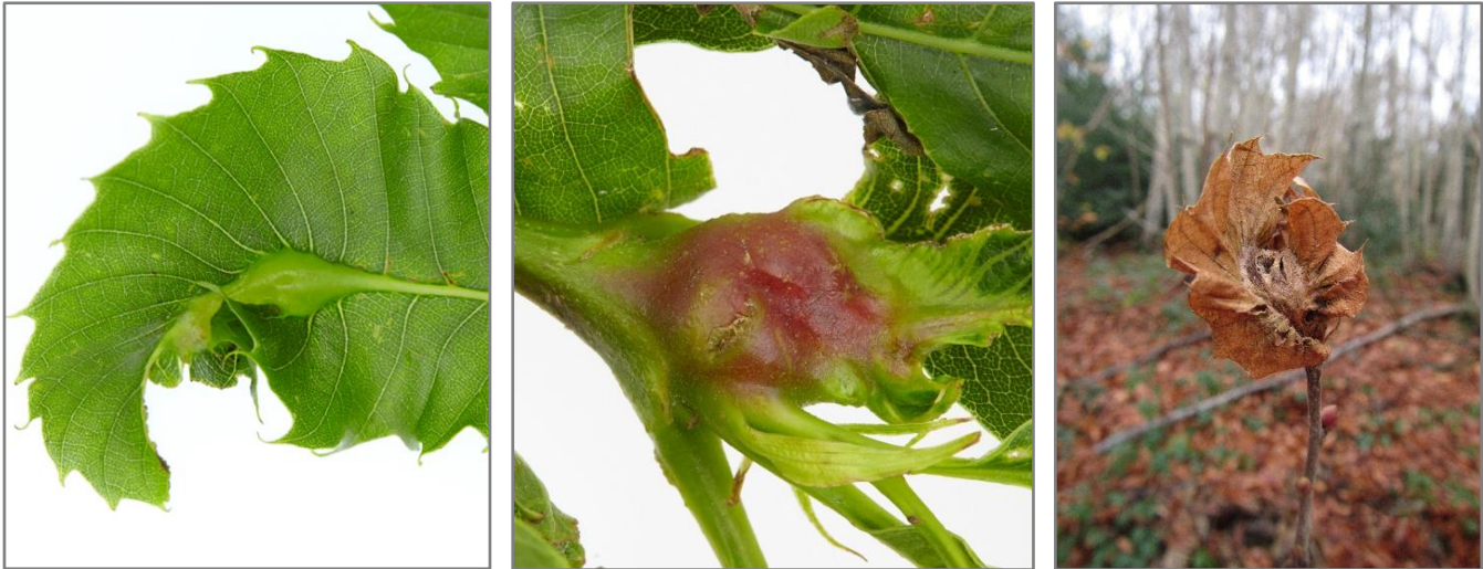
Figure 4: Left to right - fresh OCGW gall on the mid-rib of a sweet chestnut leaf, an older gall showing the characteristic rosy-pink colouring that develops, and an old gall with exit holes still attached to the shoot in winter (all ©Crown copyright. Forest Research).