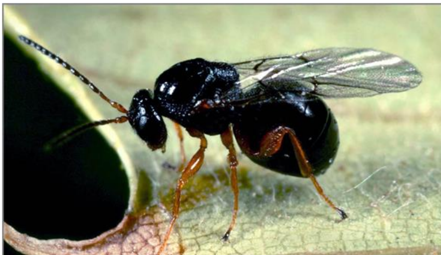
Figure 3: Adult female OCGW

The adult female OCGW is very small and unlikely to be seen, around 2.5 to 3.0 mm long (fig. 3). The most obvious sign of their presence are the galls which form on twigs or in the petiole (leaf-stalk) or mid-rib of leaves where they cause leaf distortion and deformity. Initially they are either green or pink but as they age they turn first red and then brown (fig. 4). Galls on leaves fall from the tree in the autumn but those on twigs can remain on the tree for two years or more where they stand out in winter.