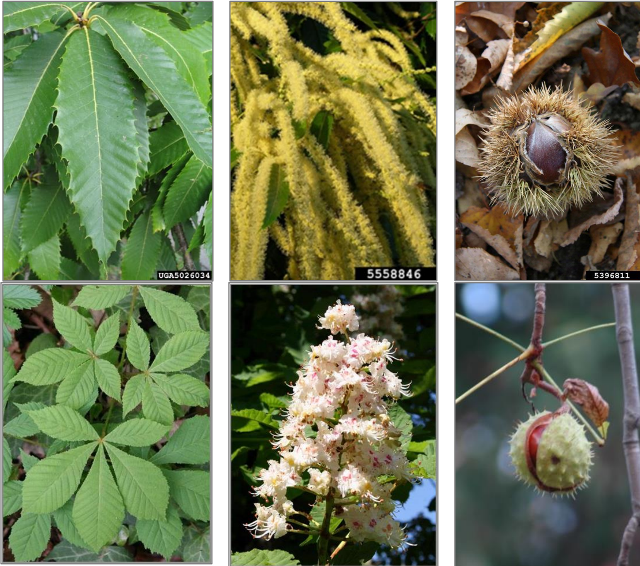
Figure 2: Top row, left to right - sweet chestnut foliage, fully expanded male flowers, and spiny fruit case with nut. Bottom row, left to right - horse chestnut leaves, flowers, and fruit case with nut.

Observatree is a citizen science project led by Forest Research, in collaboration with key organisations