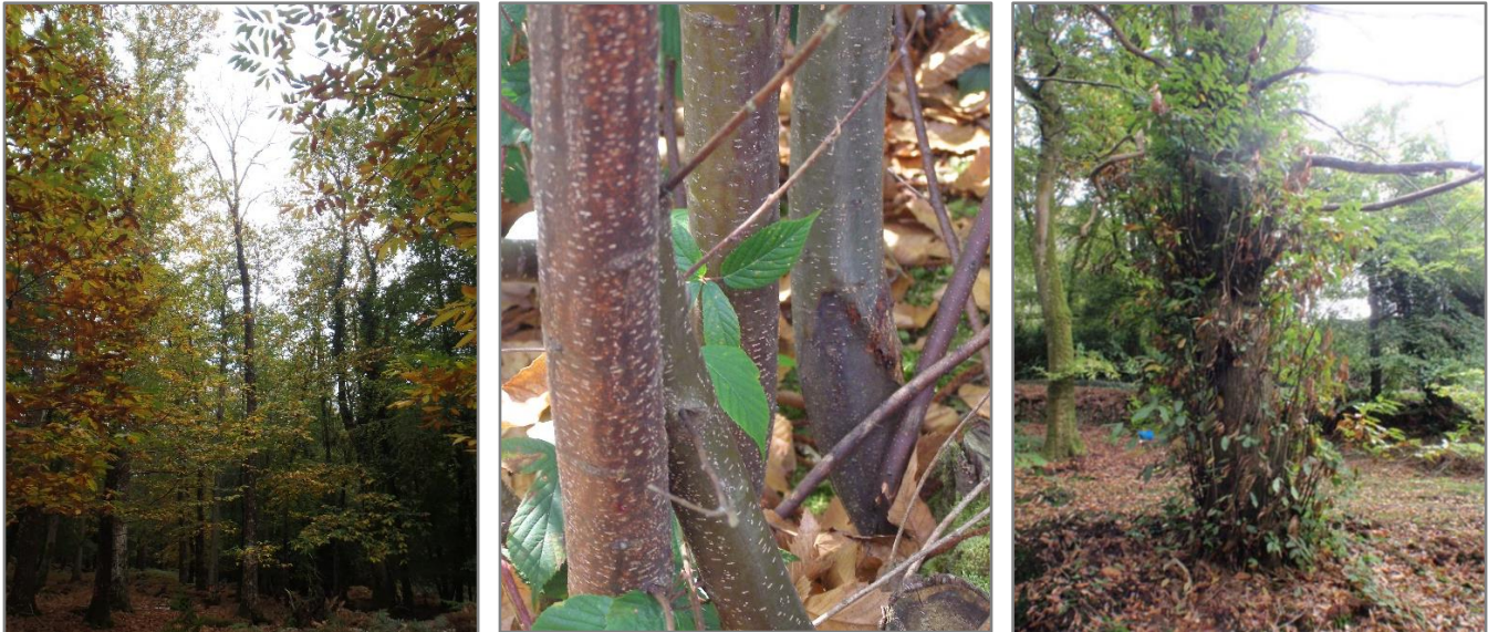
Figure 7: Left to right – sweet chestnut with dieback and leaf browning caused by P. cinnamomi , basal lesions caused by P. cinnamomic , and abundant epicormic shoots on infected trees where P. ramorum is well established (©Crown copyright, Forest Research).