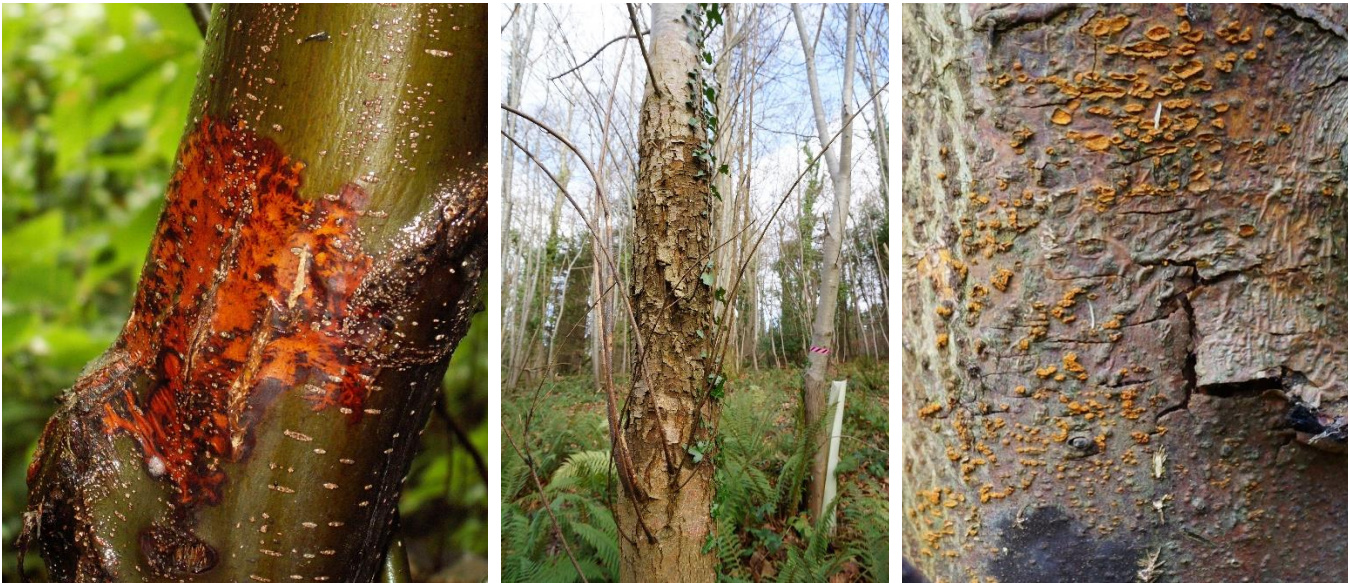
Figure 5: Left to right – bright orange-brown sunken canker on young branch, ragged canker with abundant epicormic shoots on an older stem, and yellow-orange fruit bodies.

The fungal spores are spread mainly by wind and water but may also be transmitted by birds and insects. Spores enter host trees through fissures and wounds in the bark where they germinate and spread, rapidly forming lesions. Externally these lesions present as sunken and often brightly coloured cankers on younger material and roughened cracked cankers on older (fig. 5) which eventually girdle stems and branches, cutting off the flow of water and nutrients to tissues above it. Leaves above cankers gradually wilt and die, whilst below the canker there are often many epicormic shoots (fig. 5). Fruit bodies are frequent and appear as yellow-orange pustules on infected bark (fig. 5).